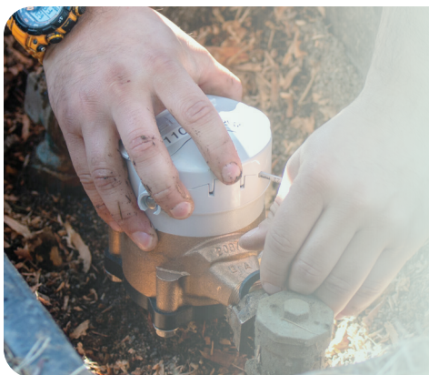
Above, installation of an advanced water meter