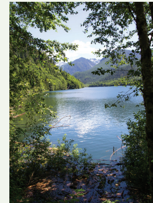
South Fork has covered picnic areas