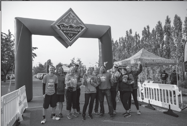
PUD employees volunteered their time to cheer on participants!

W e were proud to partner with Snohomish Running Company to offer the first-ever Run for Warmth 5K/10K in Snohomish last month. This was our first year sponsoring the Run for Warmth and a portion of the proceeds raised by the run will benefit our Project PRIDE program. Thank you to everyone who came out to run or walk, volunteered or just spent some time at our PUD booths during the event.