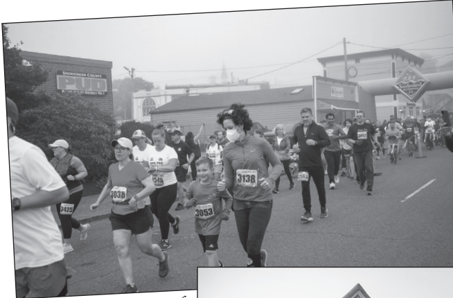
Excitement at the start of the event!