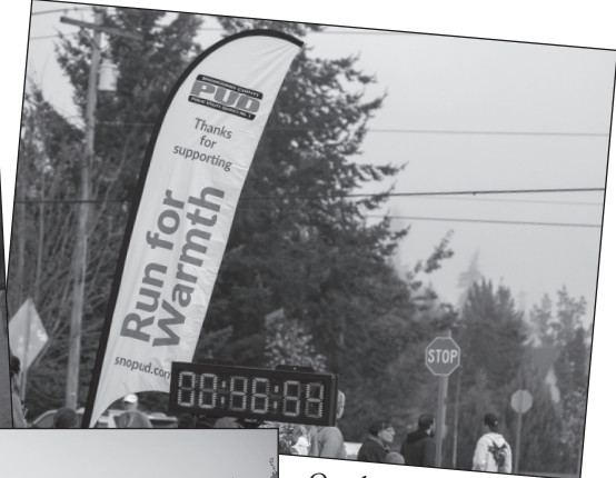
Our banner at the finish line was a happy sight for participants!