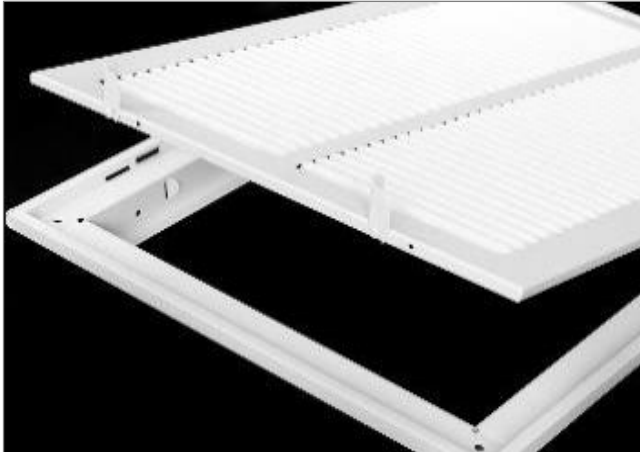
Filter grill(s) showing installed filter size and MERV rating (if applicable)