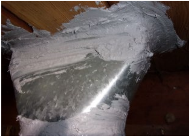
Pre-insulation locations of sealed ducts. (Dovetails, Elbows, Ys)

Duct sealing and insulation [Need PRE and POST condition photos]