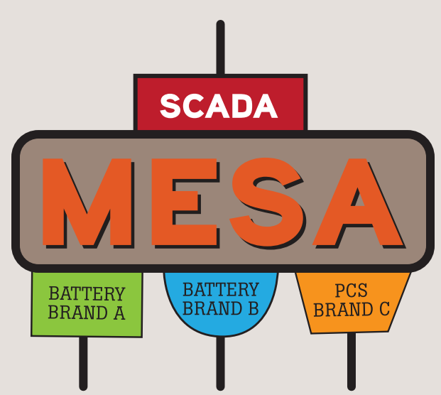
MESA offers plug-and-play connectivity to both vendors and utilities.

Modular Energy Storage Architecture (MESA) is an open, non-proprietary set of specifications and standards developed by an industry consortium of electric utilities and technology suppliers. Through standardization, MESA accelerates interoperability, scalability, safety, quality, availability, and affordability in energy storage components and systems.